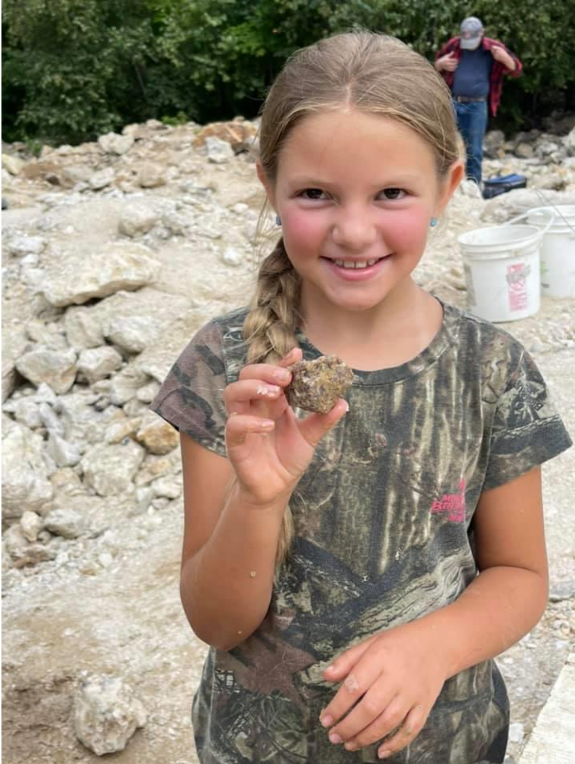
New Rockhounds born every day!