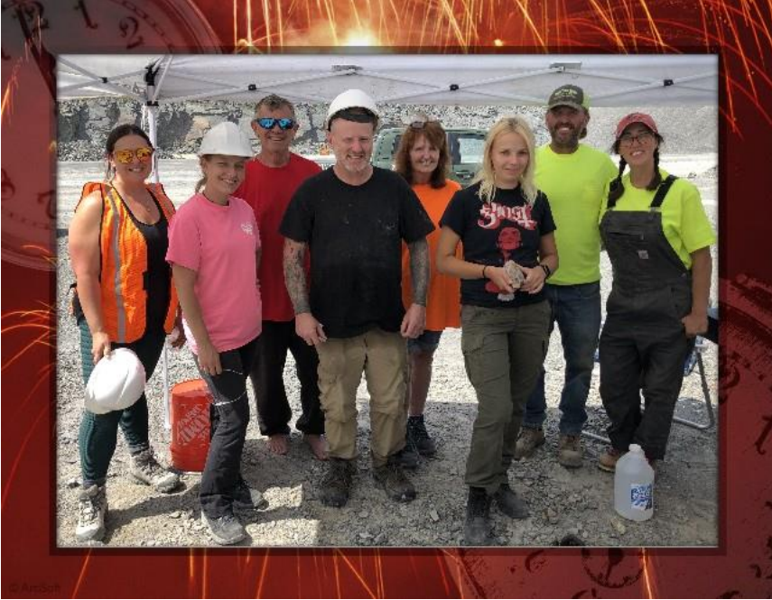
The Best Finds of the Year!