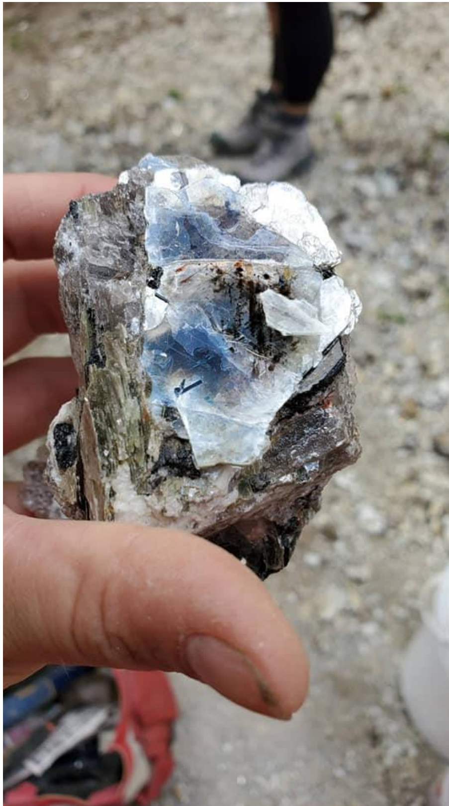
Hewitt's Quarry, Haddam, CT