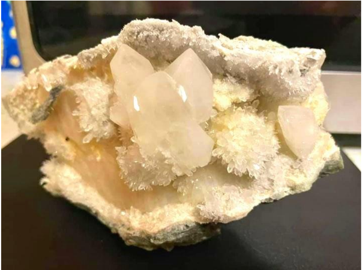
J.P. Keating Quarry 2021

Best of the Best! Got a good picture of your best Find?