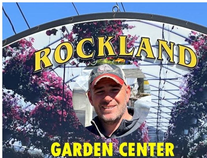
Free polished Stones Thanks to SEMMC!

Some trips may be eliminated, added, or altered depending on weather and other circumstances. Keep in touch with our Facebook Page to get the sudden additions to the digging schedule!