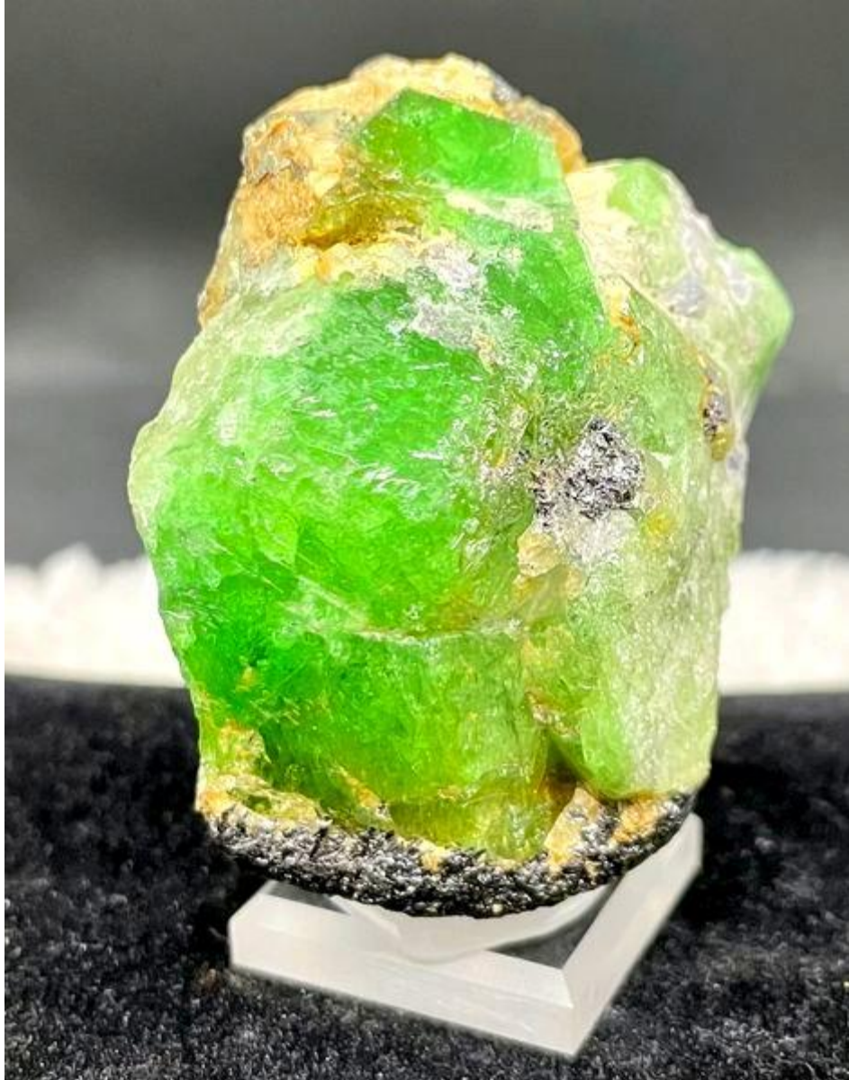
Tsavorite garnet with tanzanite and graphite. From Tanzania.