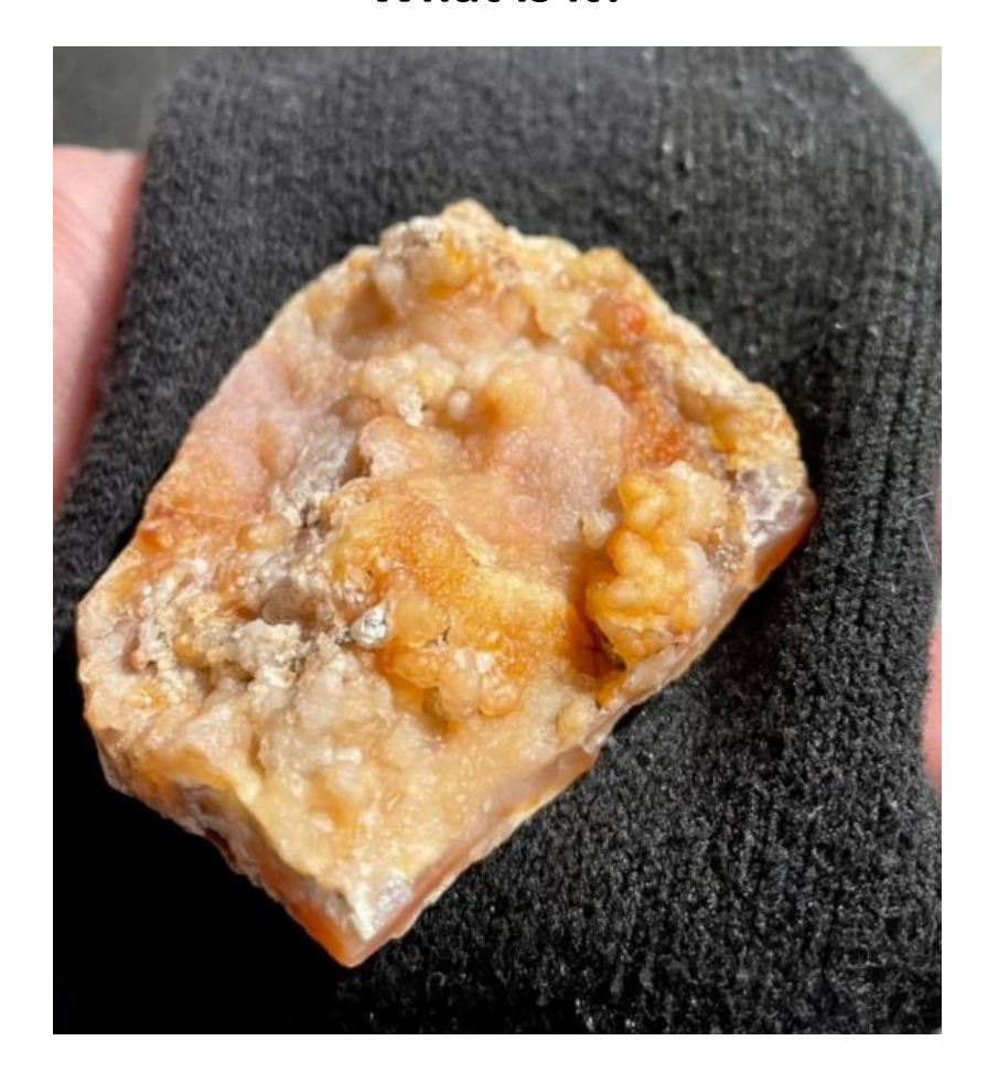
Come Join Us and find out!