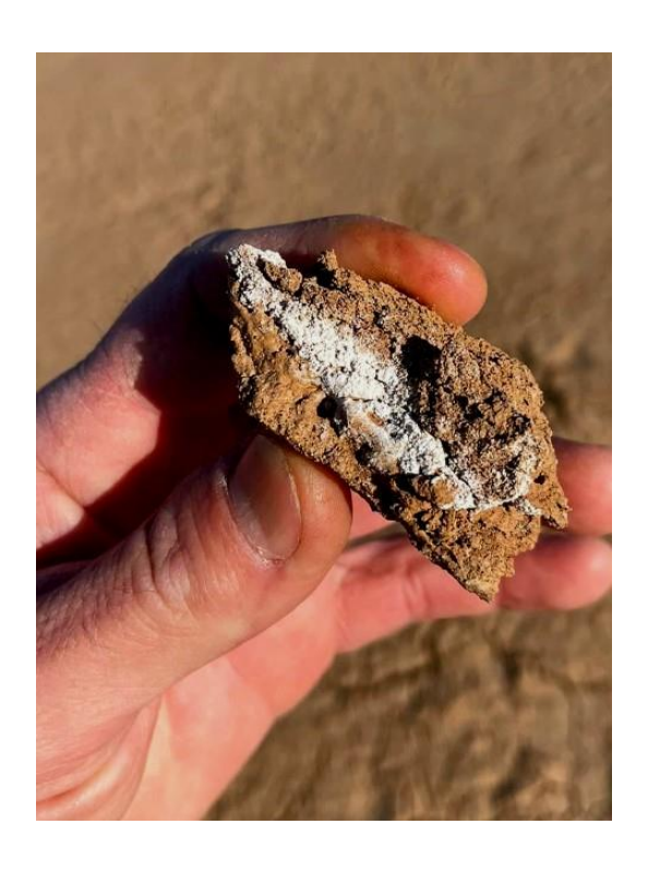
SEMMC Facebook Page

Keep in touch with our Facebook Page to get the sudden additions to the digging schedule!