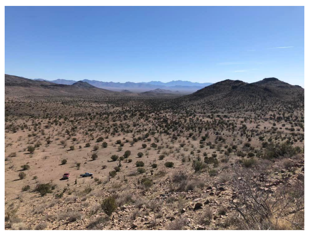
The View from Jill's Hill!