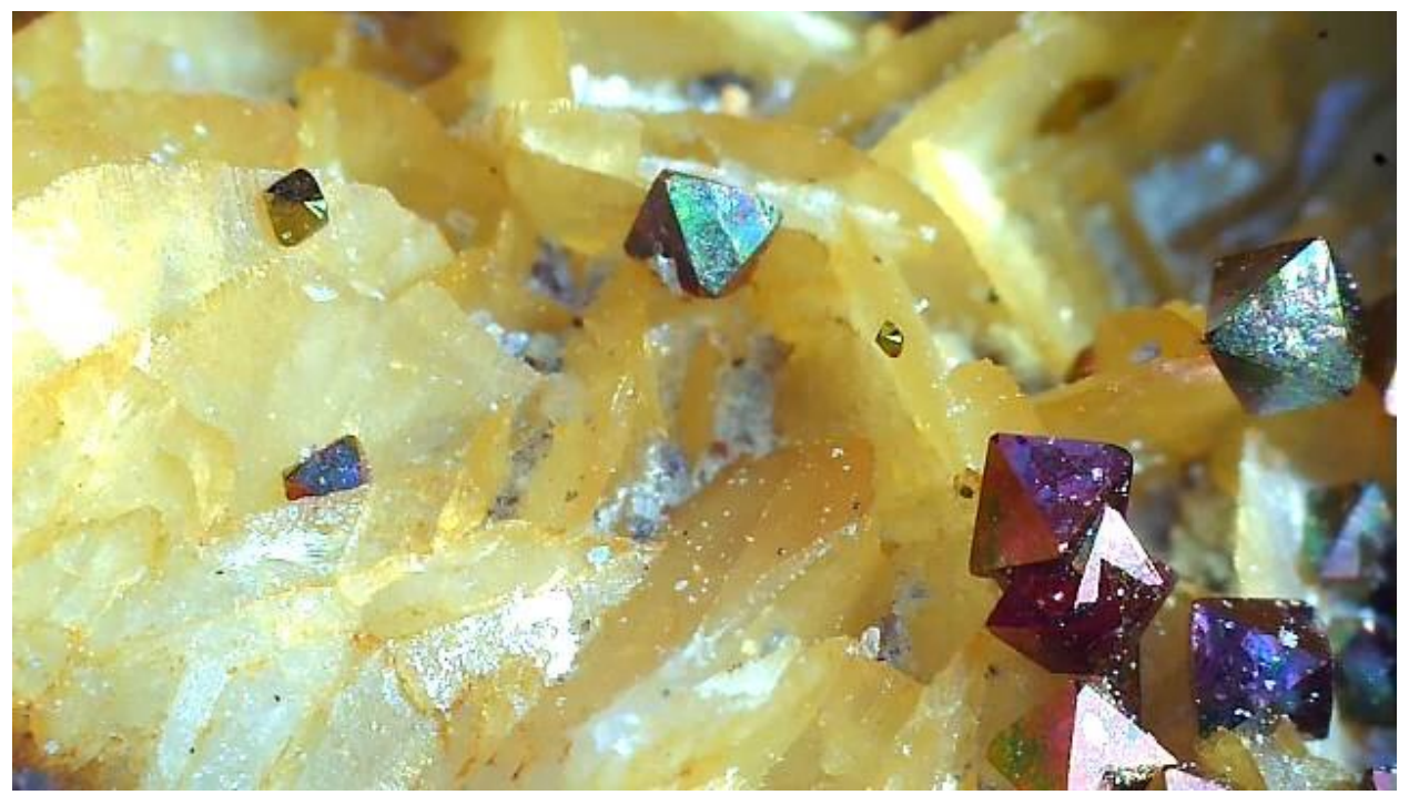
This possible fluorite piece was found at the quarry in Lunenburg by a Worcester Mineral Club member who was digging along side us.