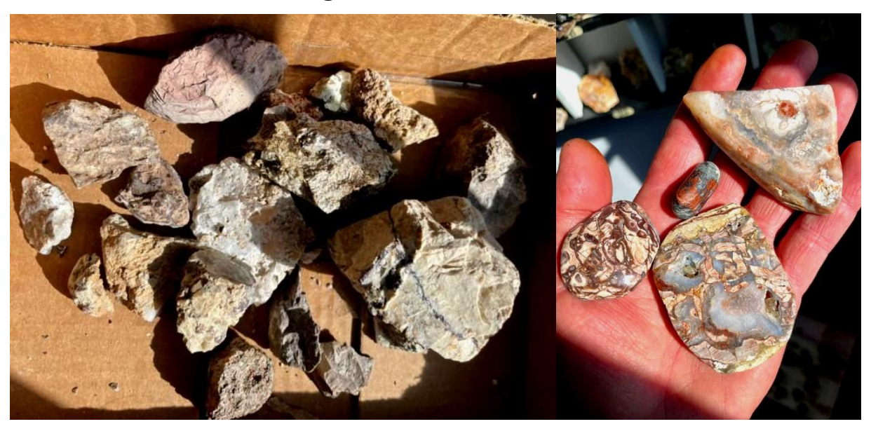
They will take you to new heights in the collector's game!