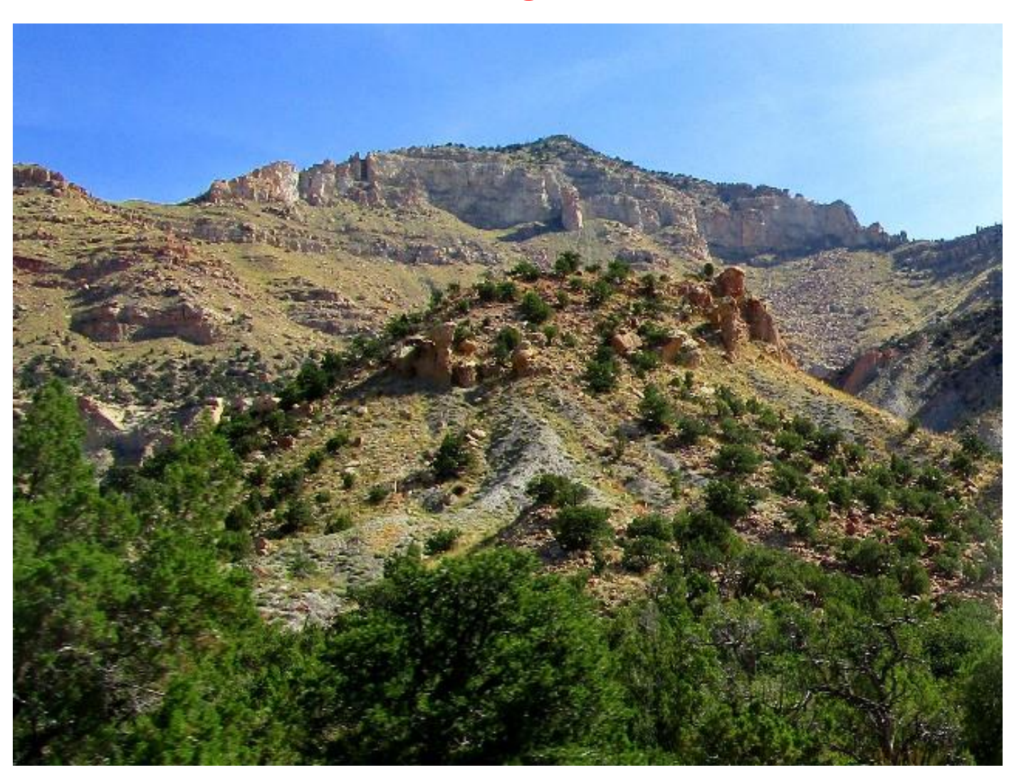
Palo Duro Canyon